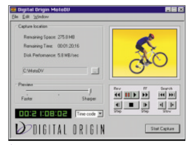
Capture via 1394 with device control