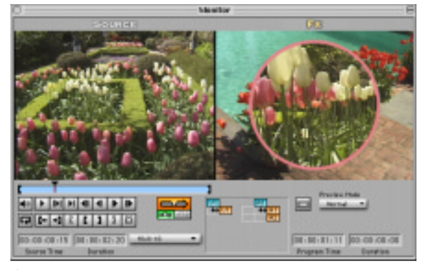
🛓 Edit with Premiere LE or EditDV Unplugged